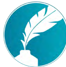
CLASS Community of Liberal Arts and Sciences Students