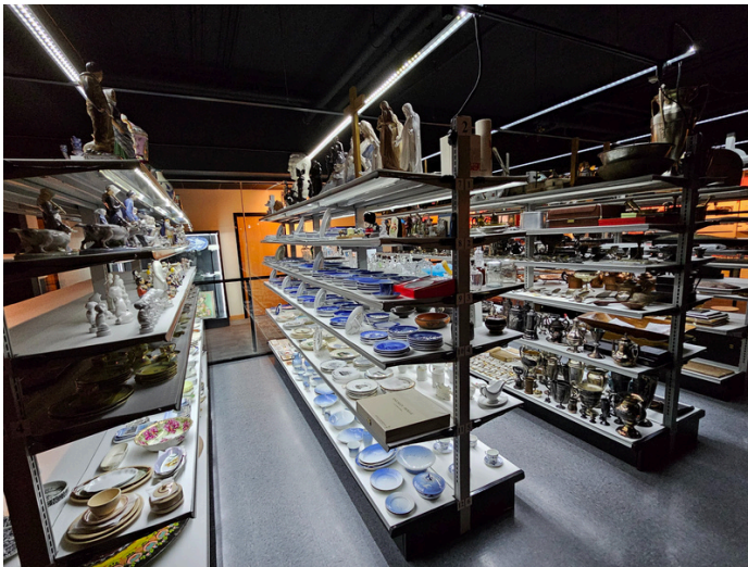
The photo above is an inside look at the Museum of Danish America's collection storage area.

Embrace hands-on, experiential learning: Use opportunities such as internships, volunteering, and projects to immerse yourself in the museum field. These experiences, along with your connections, weigh heavily in applications—often more so than any grades or coursework. Not only will they sharpen your skills, but they will also offer invaluable insights into the daily workings of museums.