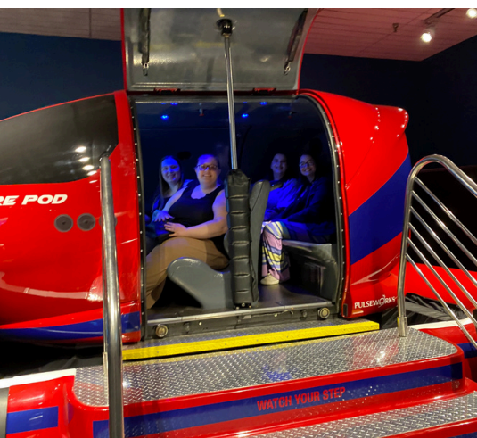
Students on the flight simulator at the St. Louis Science Center