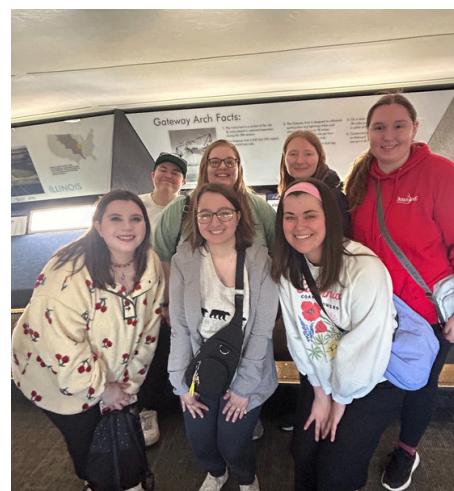
GEMS at the top of the St. Louis Arch