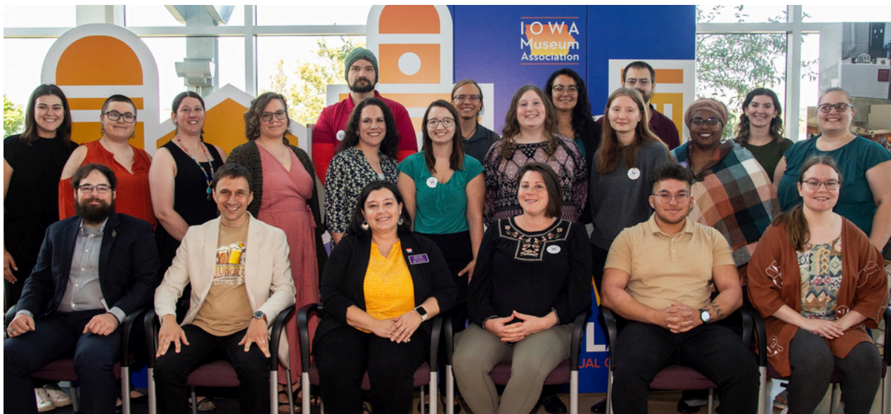
Current students, faculty, and alumni attending the IMA 2023 conference in WIU's Riverfront Hall.

Sessions went all day, and students were encouraged to attend all the sessions they could at no cost. Faculty, alumni, and current students presented their research in breakout sessions.