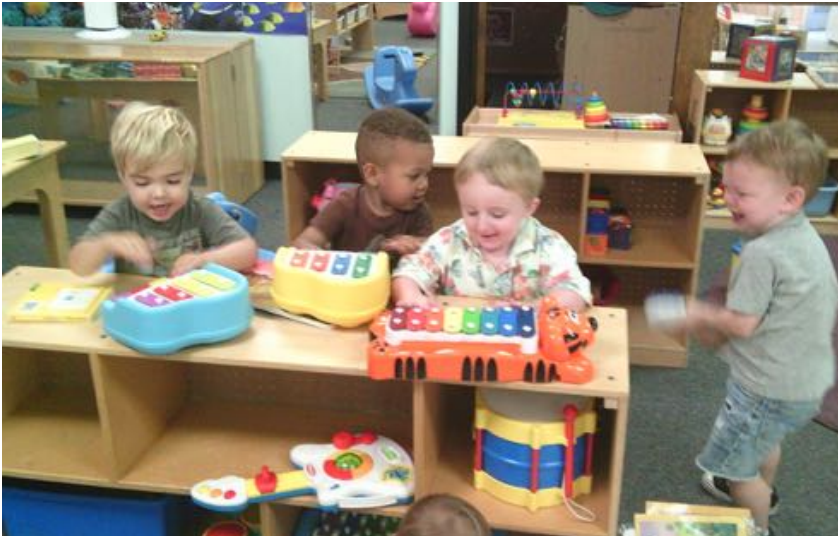
Playing Those Musical Instruments and Singing Songs!