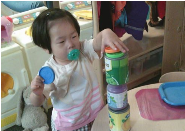
Making Tall Towers

Standard: Children demonstrate the ability to remain engaged in experiences and develop a sense of purpose and follow-through.