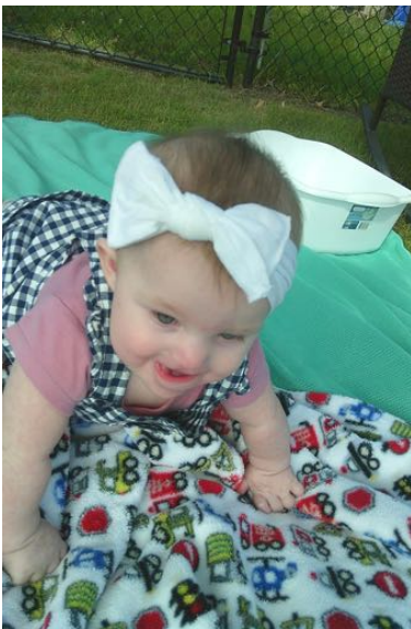
Crawling and Enjoying Our Playground