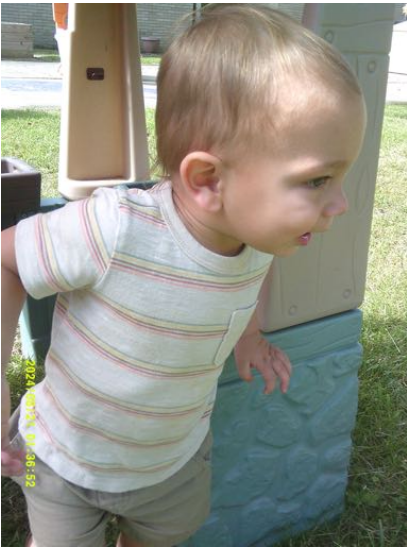
Enjoying the Small Playhouse