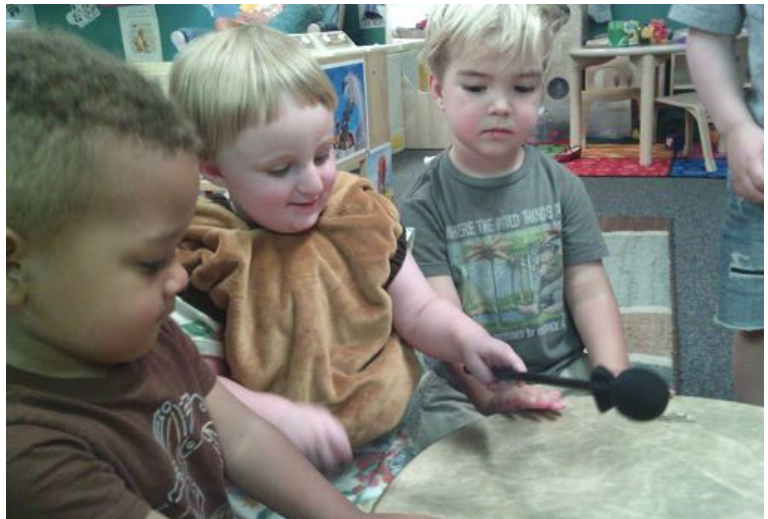
Sharing Songs and Playing the Gathering Drum

Standard: Children demonstrate the ability to use knowledge, previous experiences, and trial and error to make sense of and impact their world.