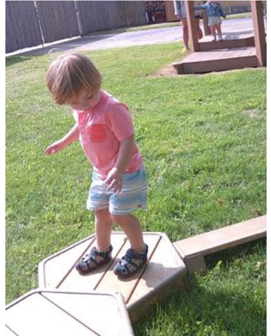
Balancing on our Wooden Tiles