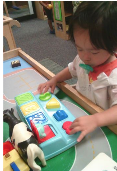
Discovering the Toys in our Room