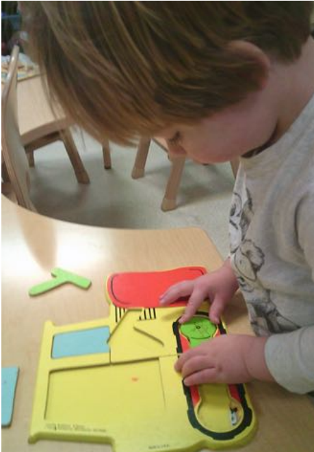
Putting Together our Puzzles