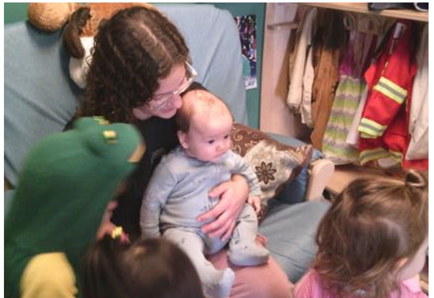
Welcoming Our New Friend

Standard: Children demonstrate the desire and develop the ability to engage and interact with other children.