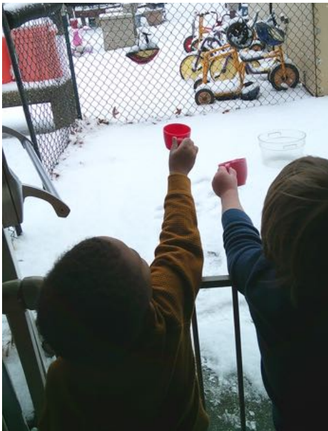
Trying to Catch the Snowflakes!