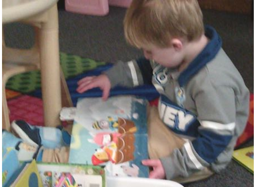
Exploring Our Books