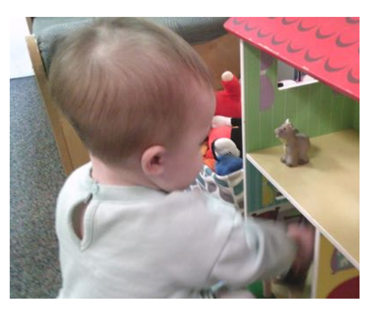
Exploring the Dollhouse