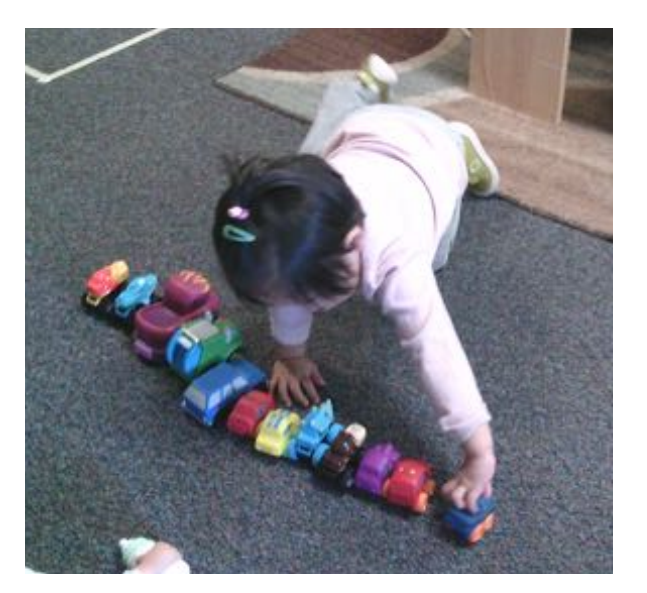
Placing All the Cars in a Row