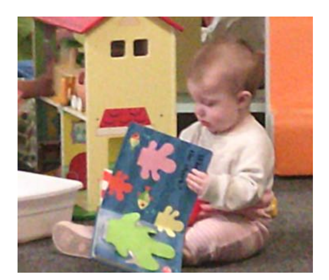
Discovering Books in our Room

Standard: Children demonstrate interest in and comprehension of printed materials.