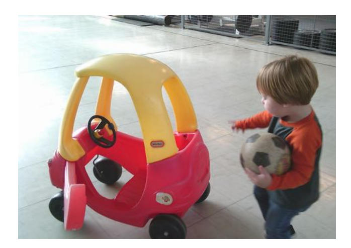
Playing in our Gym