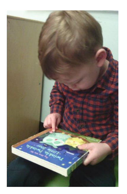
Exploring our Books