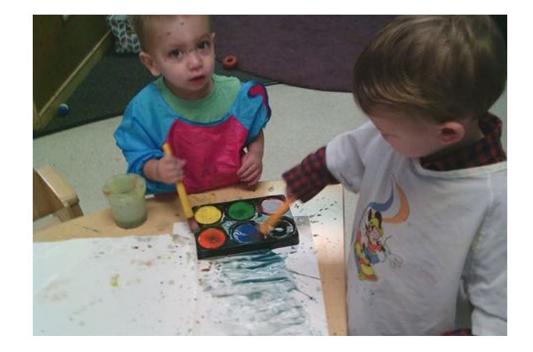
Creating Water Color Pictures