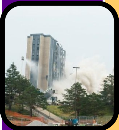
Wetzel Hall July 2012