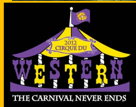
Above: Some first year cohort members enjoy the parade. Middle: 2012 Homecoming Theme- "Cirque Du Western" Below: A few 2nd year cohort members wait for the parade to start.