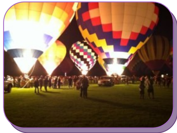
Balloon Rally/Balloon Glow 2012