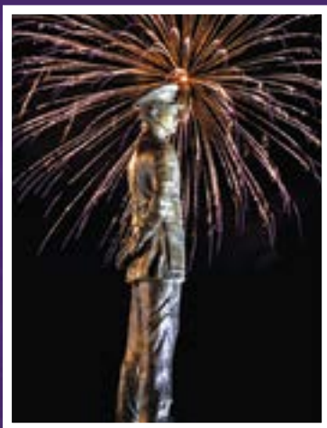
Col. Rock Hanson Statue

Interested in learning about WIU's Graduate School? Join us for an informational session. For more information and to register, visit wiu.edu/grad/openhouse .