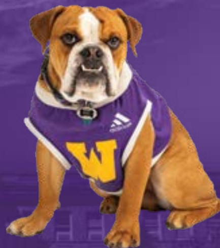
Col. Rock IV (Ray)