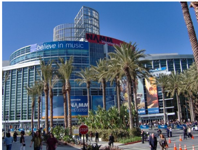
A view of the Anaheim Convention Center at the 2008 NAMM Show

Going to the 2008 winter NAMM show was certainly a memorable experience. Every WIU student soaked up every bit of information like a sponge and found it to be fun as well as beneficial. The show went by so fast and I felt as if our time in Anaheim didn't last as long as it should have. I had a great time, and look forward to seeing familiar faces next year at the NAMM show which will take place January 15-18, 2009.