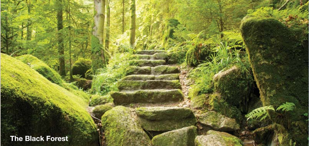
The Black Forest