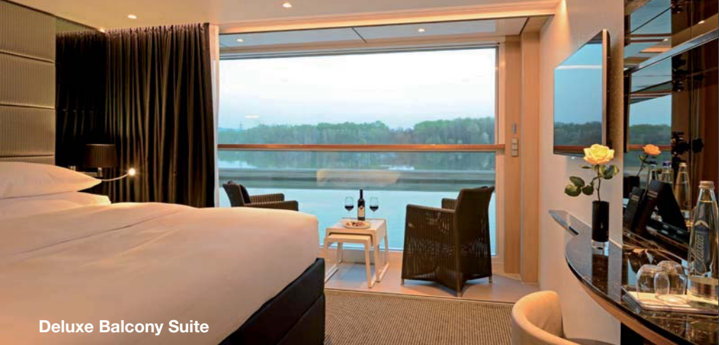
Deluxe Balcony Suite