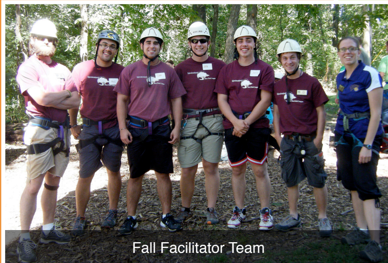
Fall Facilitator Team

Western with my Bachelor’s in Business Management, and I now look forward to pursuing my Master’s in RPTA. As a new graduate assistant at Horn Field Campus, I will be dedicated to keeping this place clean, safe and beautiful.