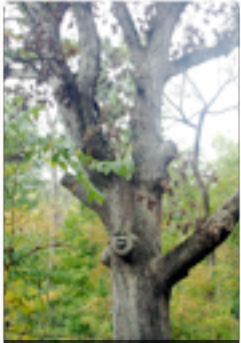
The Lone Wolf Tree

THE PERIODIC NEWSLETTER OF HORN FIELD CAMPUS