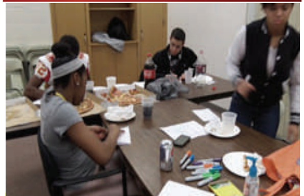
PACERS students participating in a service learning project