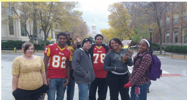
PACERS students at the University of Iowa

Check out our website at: www.wiu.edu/coehs/qc/cned/pacers/