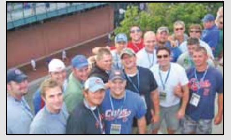
WIU Alumni and Friends