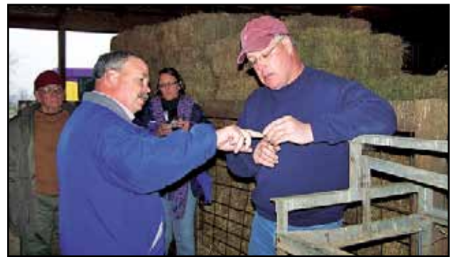
Participants of the Illinois Council on Food and Agricultural Research (C-FAR) Day toured Western's goat facility on the Macomb campus.