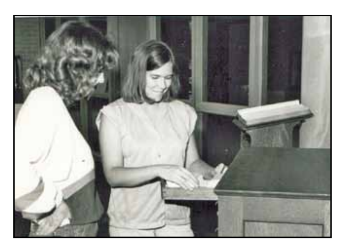
The future archivist, right, first came to Western in 1970.

-The first Brophy Hall (Morgan Gym) was a multistoried building prior to the fire that devastated it in the Fall 1970, after which the top level was removed. Now a much "flatter" building, people know it as the location of the Courier office and Heating Plant. A neighboring building, currently the Art Gallery, was built as the campus's powerhouse, then used as an early classroom building for Western students (the Academy). It was subsequently used to house a number of campus offices such as the music department and Courier offices.