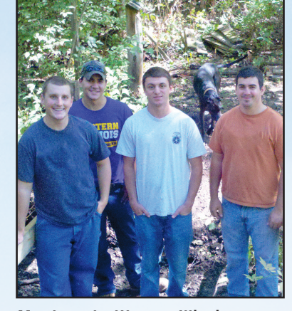
Members the Western Illinois Construction Management Association (WICMA), a professional student organization, standing on a bridge they designed and built at Horn Field Campus.