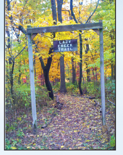
An entrance to one of the many trails at the Horn Field Campus.