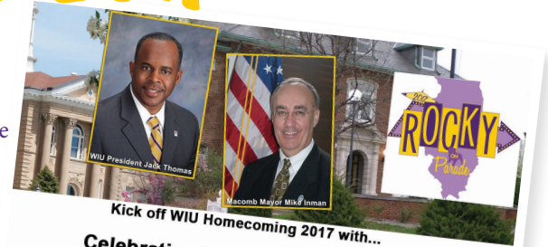
Kick off WIU Homecoming 2017 with...