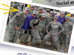
WIU Vets Reception at the Macomb Museum

Unable to join us for golf or you are not a golfer? Join us for the social and dinner to follow. Social and Dinner only: $10/person